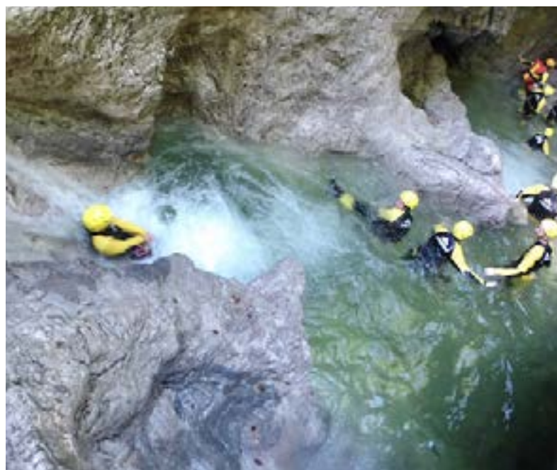
Gorges du Loup

This activity is accessible to anyone in good physical condition who is able to swim (medium difficulty).