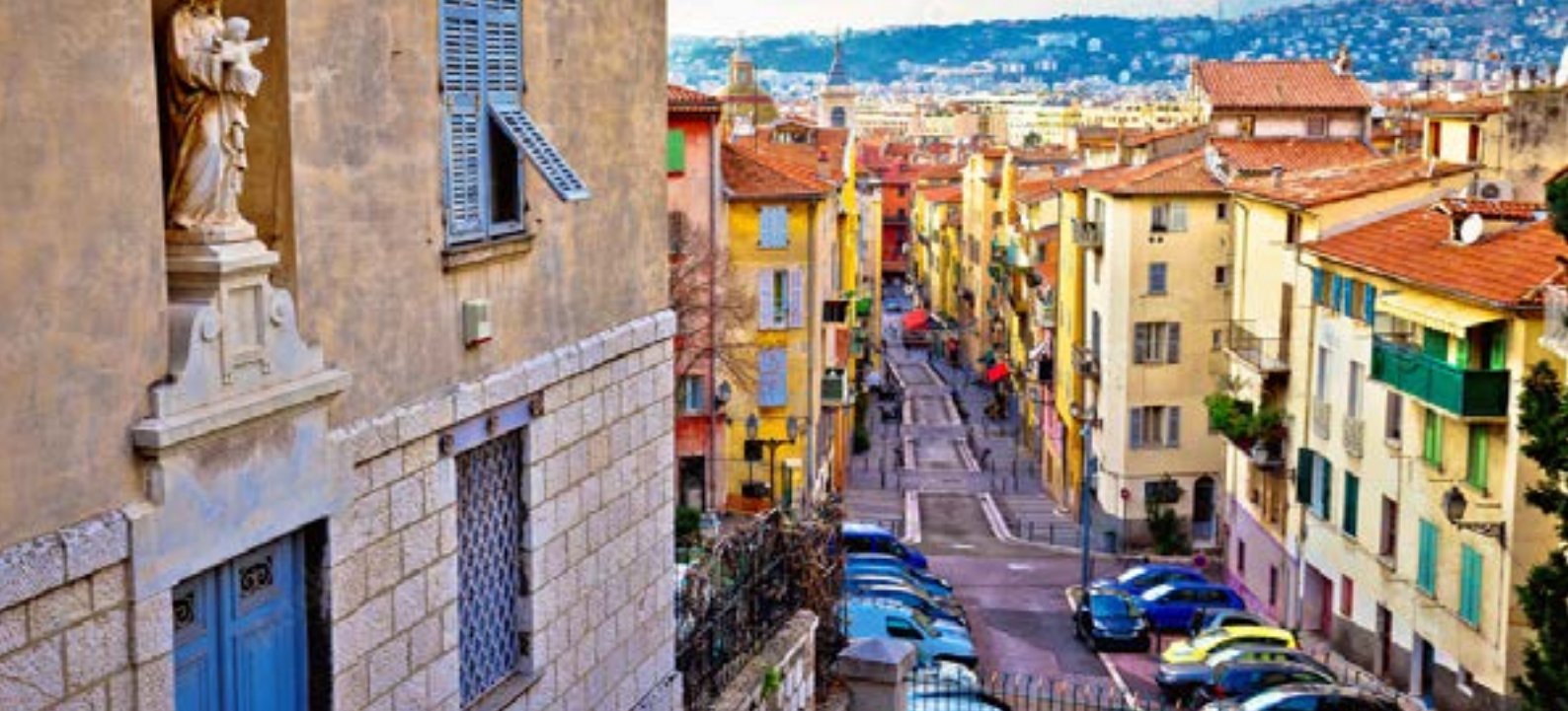
Streets of Nice