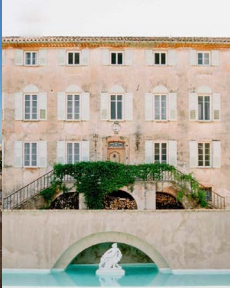
La Bastide du Roy