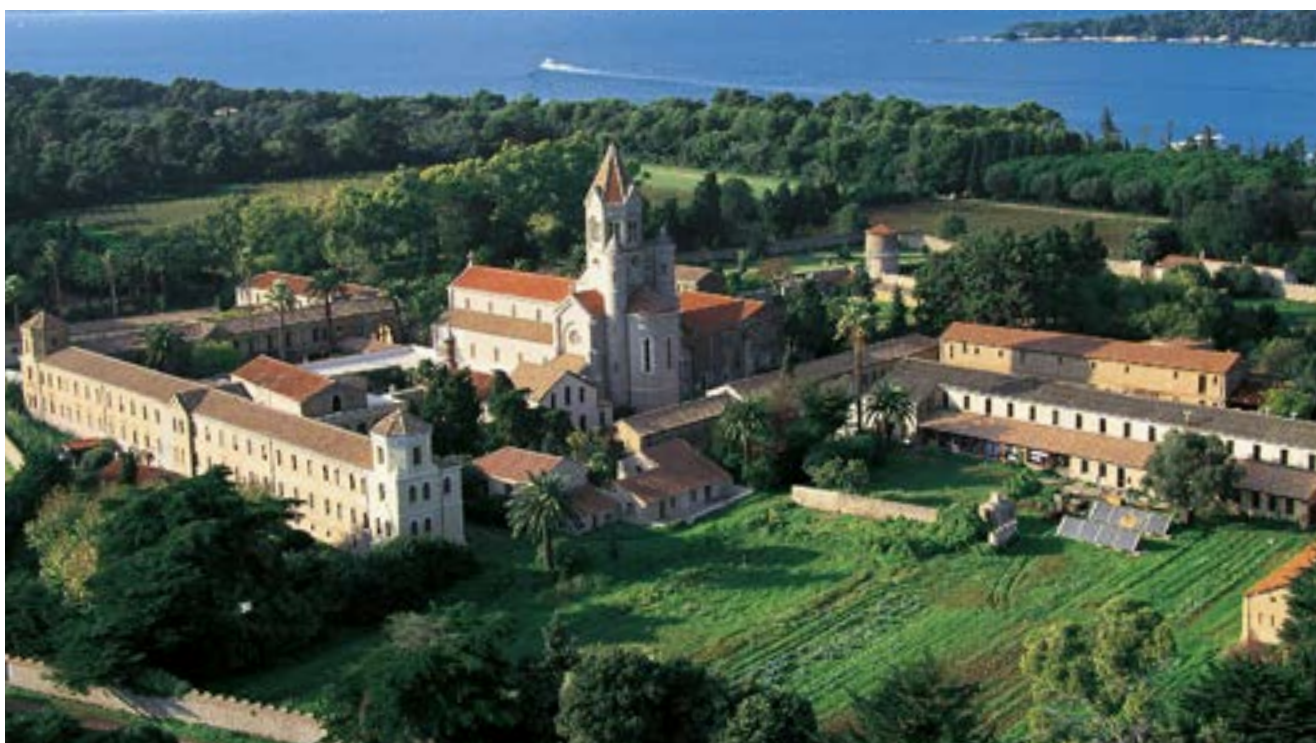
St Honorat Island

Guests will follow the paths under the pines and explore the island, whose centre is occupied by the monastery's vineyards, from which the monks draw wines and liqueurs, and where a wine tasting will take place during our tour.